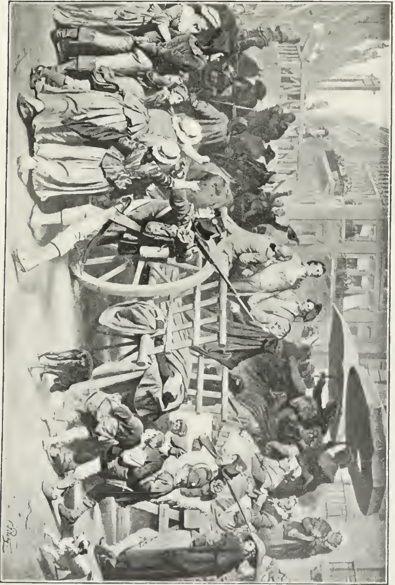
GIRONDISTS ON THEIR WAY TO THE SCAFFOLD.